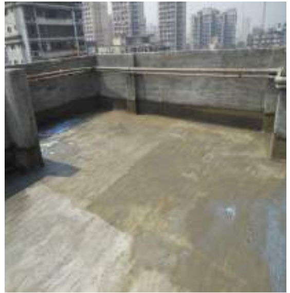
Water proof breaking slab polymer chemical Treatment for slab.