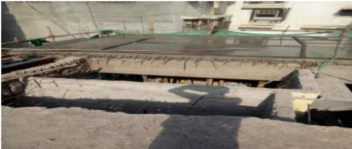
COMPLETED WITH CHIPS ON TERRACE