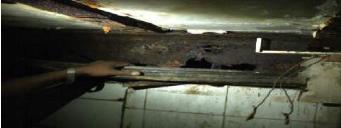
STRENGTHENING OF I BEAMS AT SITE: SIDDHIVINAYAK BUILDING