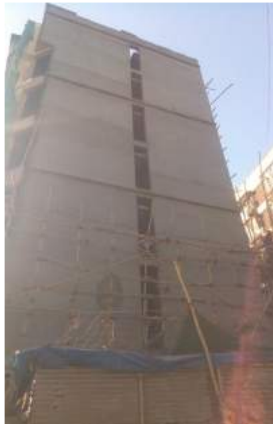
Sumer Tower No.4 CHSL - Bycullah