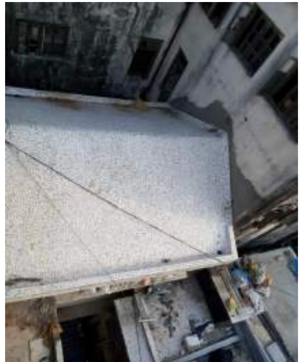
56, Ramwadi Small Triangles shaped terrace waterproofing work in details.