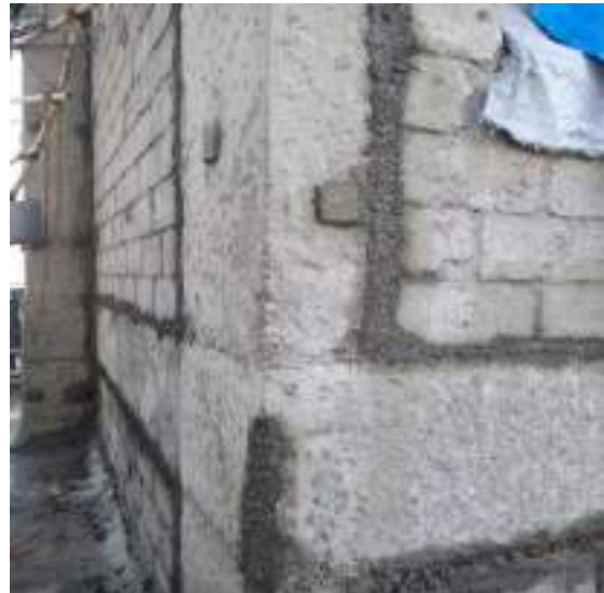
COLUMN BEAM WALL: JOINT STITCHING WORK - SITE SUMER TOWER No.03