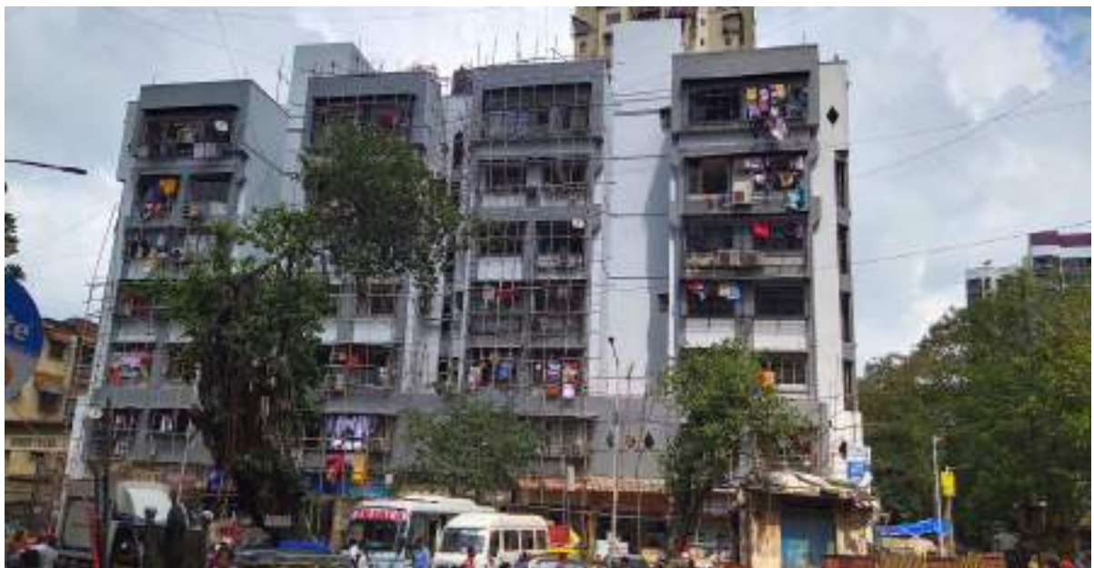
Sumer Tower No.4 Chsl Ltd - Buycullah