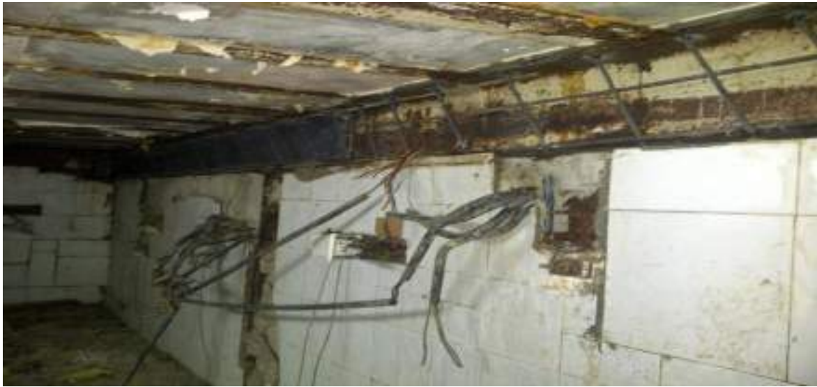
SIDDHIVINAYAK WATER PROOFING WORK IN DETAILS