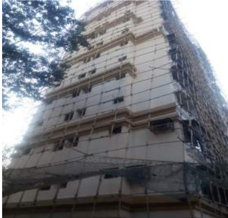
DARSHAN TOWER: COMPLETION OF PATCH PLASTER AND TERRACE WATER PROOFING PLASTER, PLUMBING AND PAINTING.